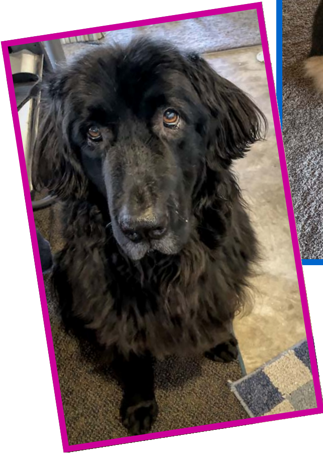
Happy Belated Birthday to Chloe Rescued January 2015