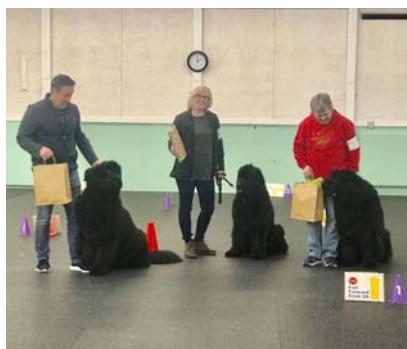
Photos from 3/16/19 Education Day, Kalamazoo...