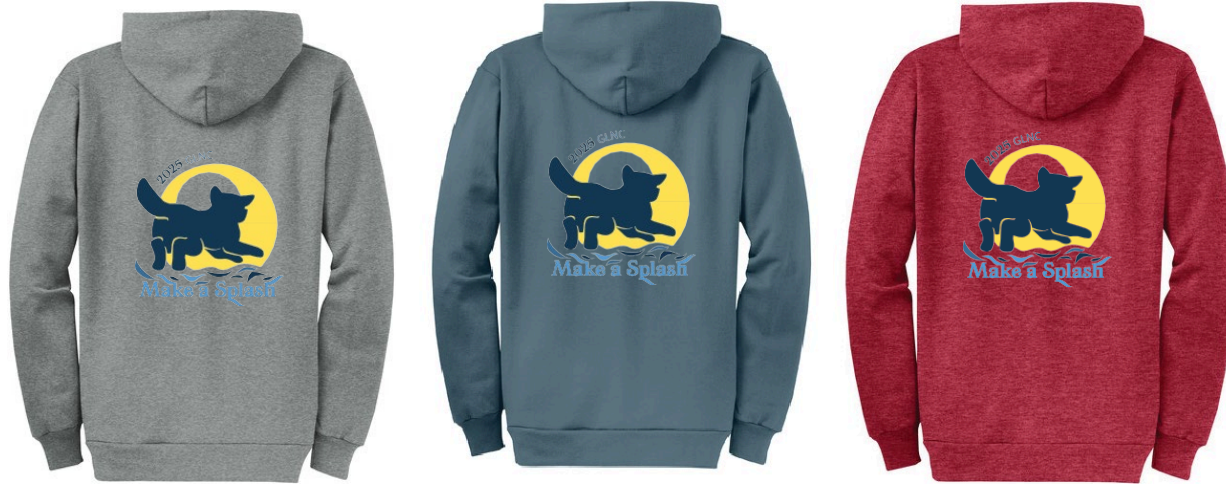
Fleece Full-Zip Hooded Sweatshirt Graphite Heather, Blue Stone, Heather Red $39 ea (+$2 for all XXL and UP)