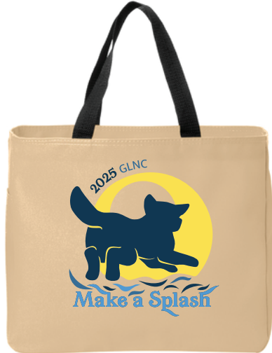
Port Authority Tote - $25