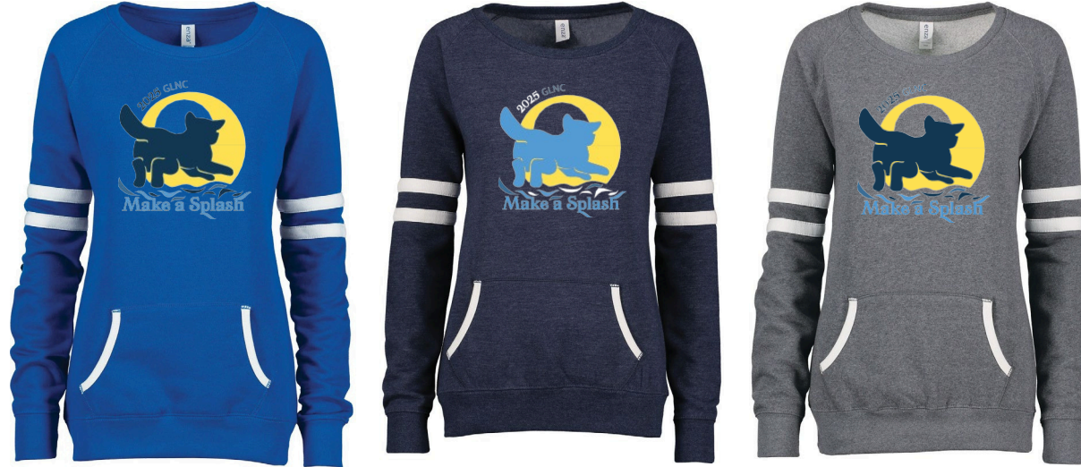
Ladies Varsity Fleece Crew Neck Pullover Royal, Heather Navy, Dark Heather $42 ea (+$2 for all XXL and UP)