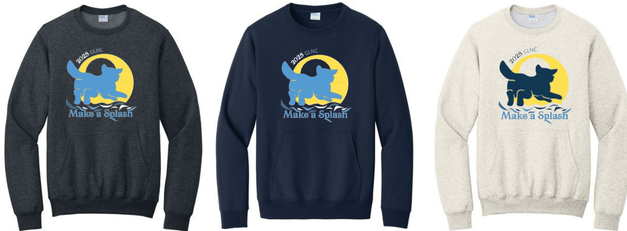
Fleece Crewneck Pocket Sweatshirt Dark Heather Grey, True Navy, Oatmeal Heather $29 ea (+$2 for all XXL and UP)