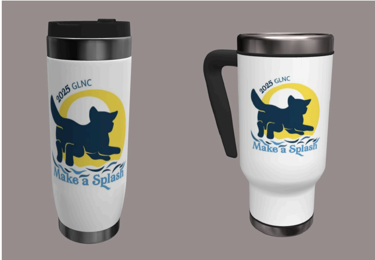
Travel Tumbler or Commuter Mug $20 ea