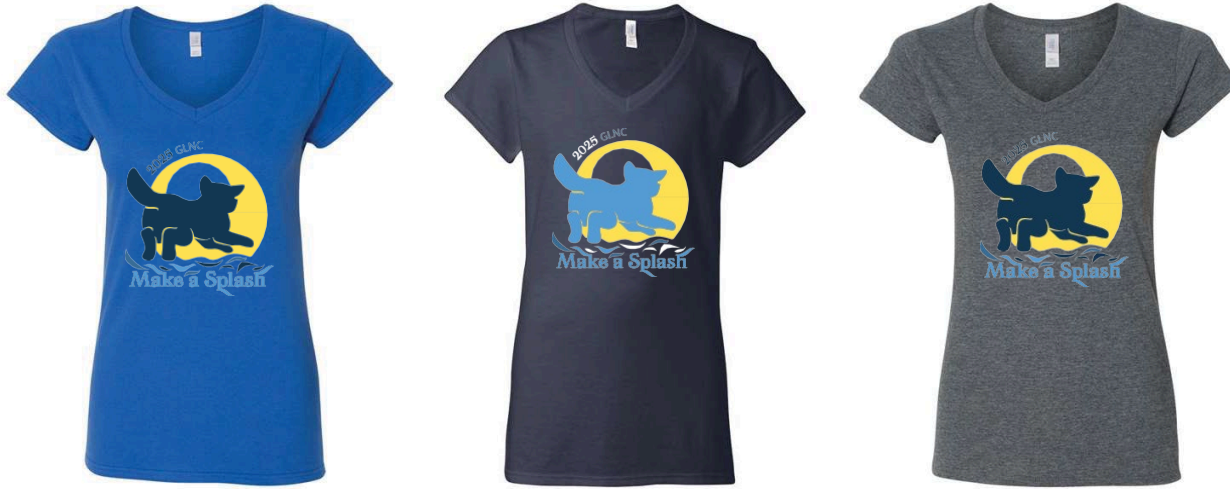
Womens V-Neck T-shirt Royal, Navy, Dark Heather $23 ea (+$2 for all XXL and UP)