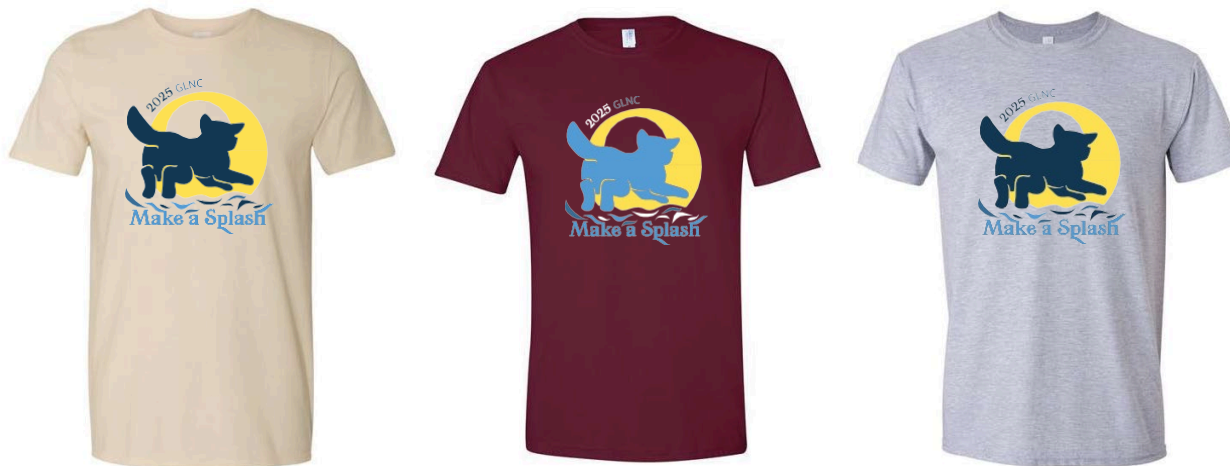
Unisex T-shirt Natural, Maroon, Sport Grey $21 ea (+$2 for all XXL and UP)