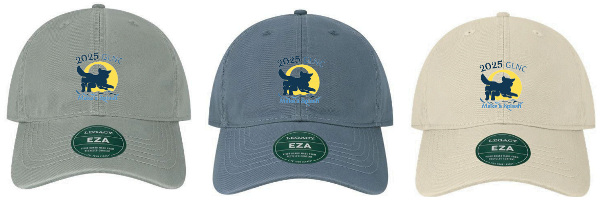
Relaxed Twill Hat Sawgrass, Lake Blue, Stone $28 ea